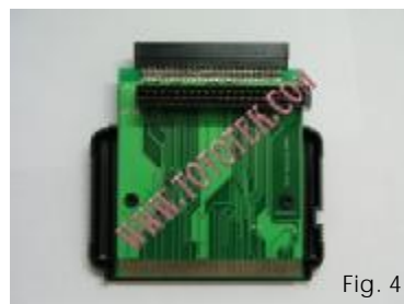
Step 3: Put the converter kit into the case.