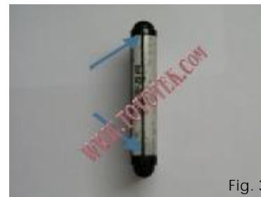
Step 3: Cut a long rectangle space on the top