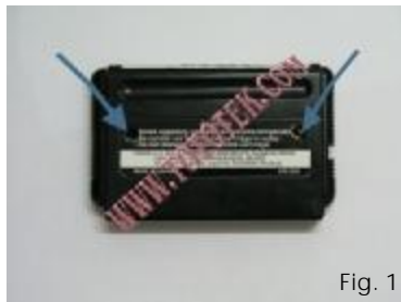
Step 1: Unscrew 2x screws on the back.

Modify the cartridge to converter, it have five step, please follow below detail :