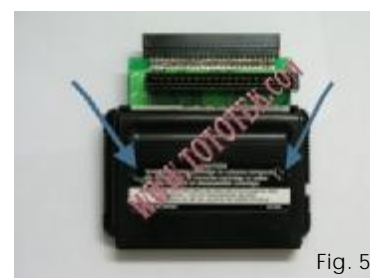
Step 4: Screw 2x screws on the back