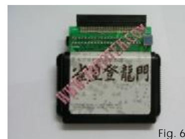
Ready to play.