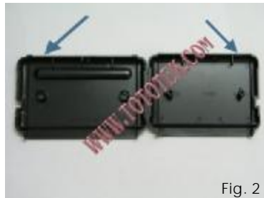
Step 2: Open the case